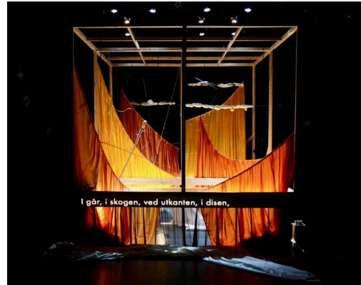
Eirik Fauske, Live – Sorgarbeid