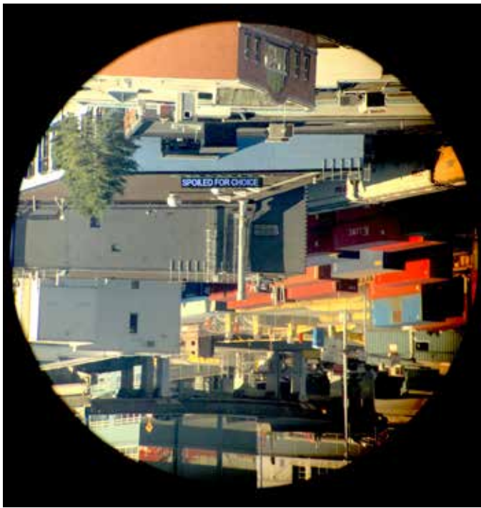
Dries Verhoeven, Fare Thee Well!