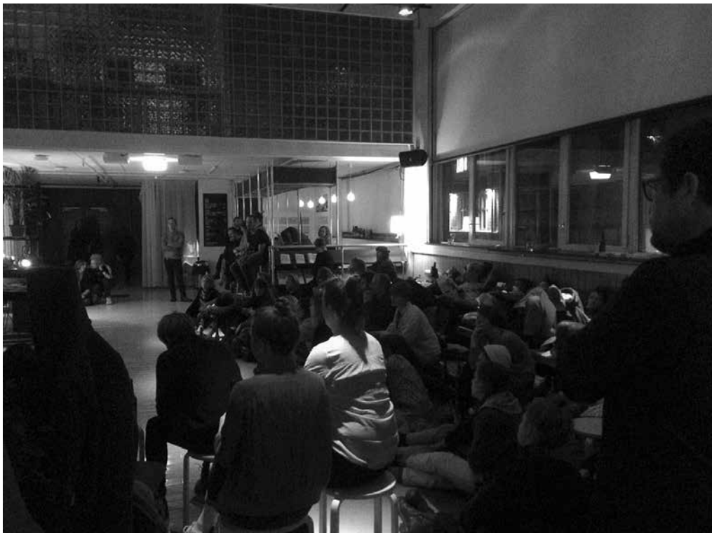
Seminar at Black Box teater