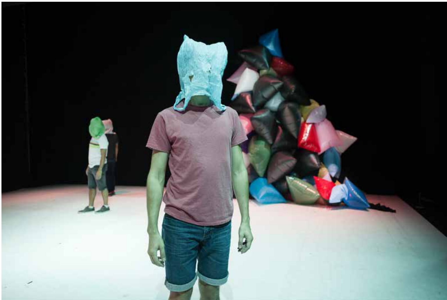
El Conde de Torrefiel, La posibilidad que desaparece frente al paisaje