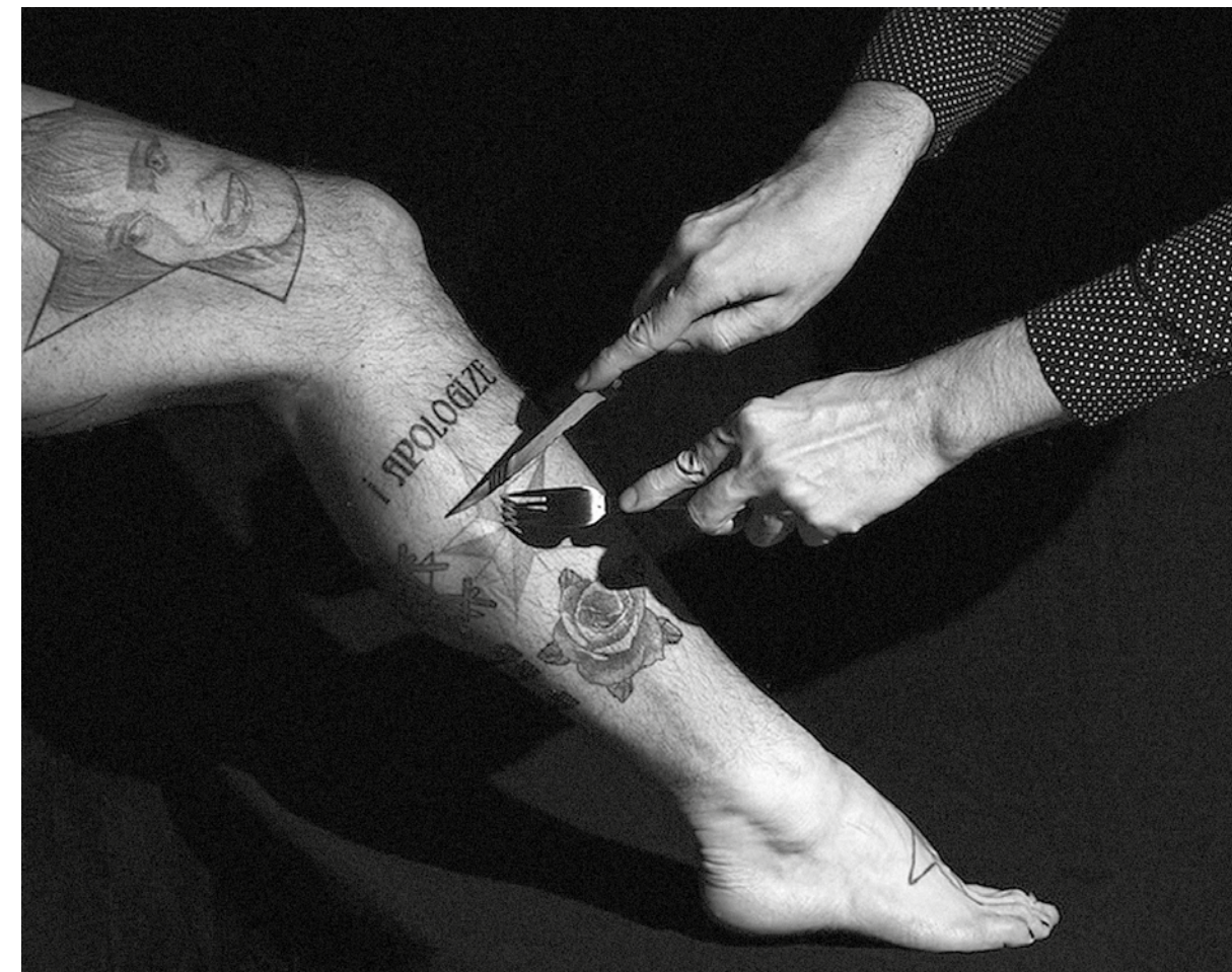
I Apologize, Concert