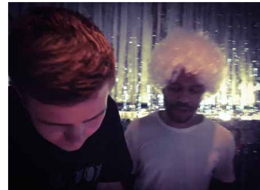
Festival Club: Dazzle and Bling