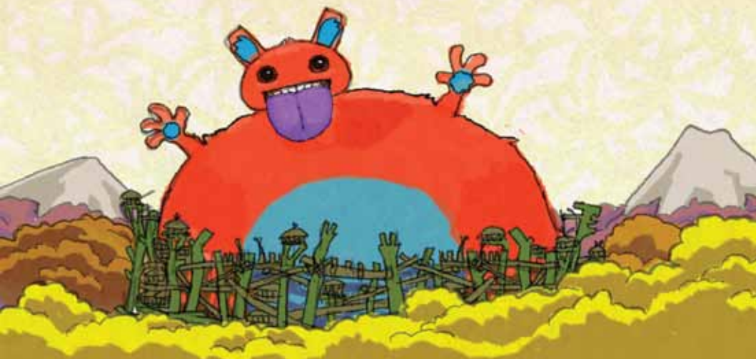
ILLUSTRATION: ASLAK HLEGESEN