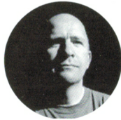
Klaus Henum Video Design/ Camera