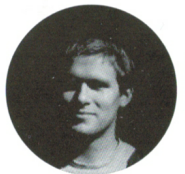
Fredrik Øiestad Lighting