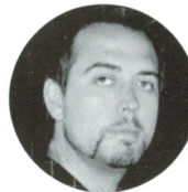
Joakim Røiseland Light Design/ Scenograph