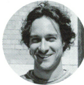
Klaus Kottmann Light Design (China)